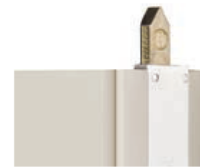
Shootbolt (For doors systems with an astragal)